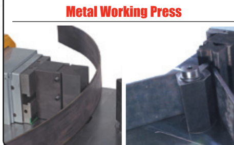
Metal Working Press