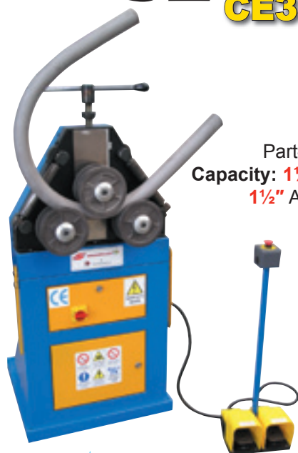
Part# CE35 Capacity: 1½" Sch. 40 Pipe 1½" Angle Iron