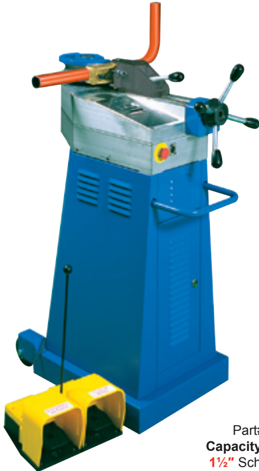
Part# 060 Capacity: 2" Tube 1½" Sch. 40 Pipe

Patents 4986104, 5469728, 5345802, 4532787, 4981030